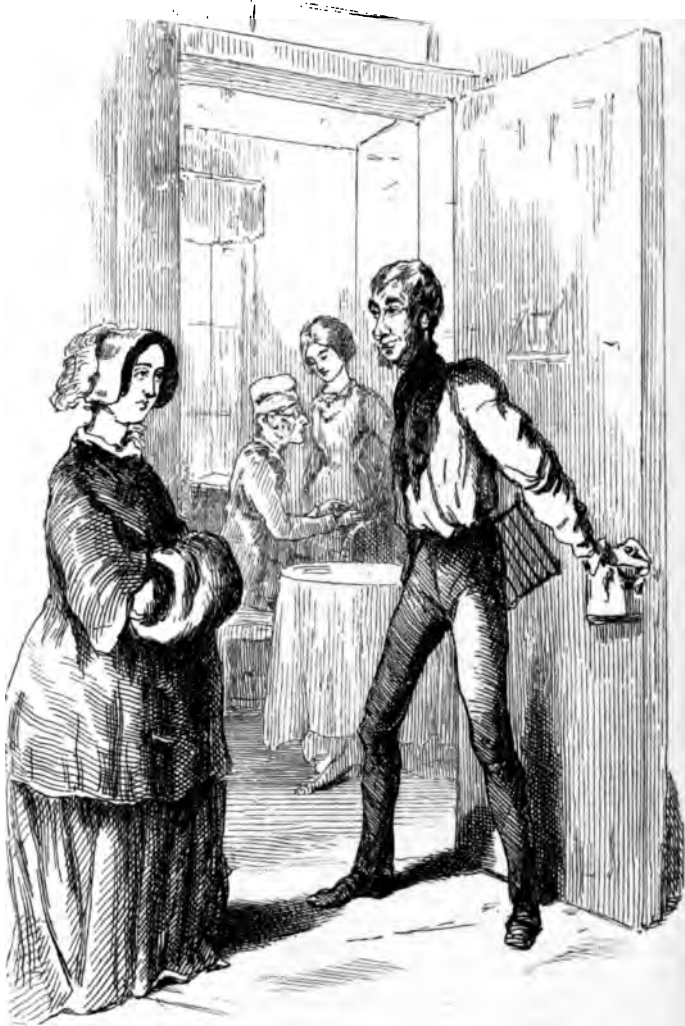
HER LADYSHIP'S VISIT